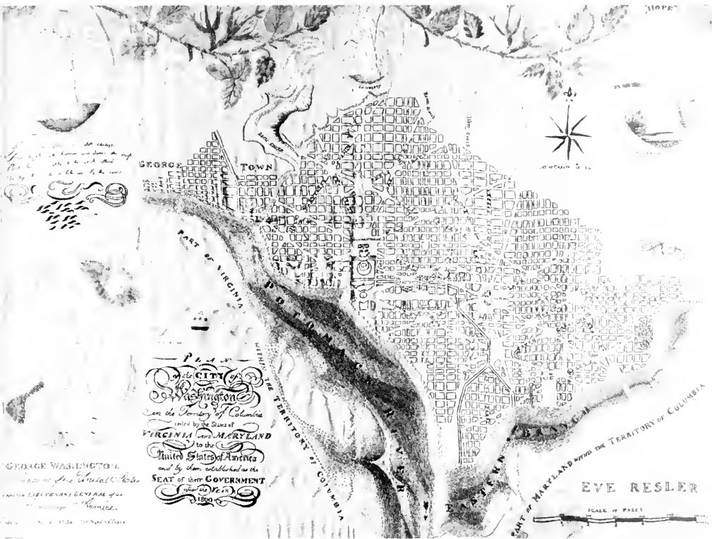
Map of Washington (city of) by Eve Resler; silk on silk; Virginia (unspecified); c. 1810. HOA 18 \frac{3}{8} "; WOA 25 \frac{3}{8} ". Courtesy of the Westmoreland County Museum and Library, Montross, Va.